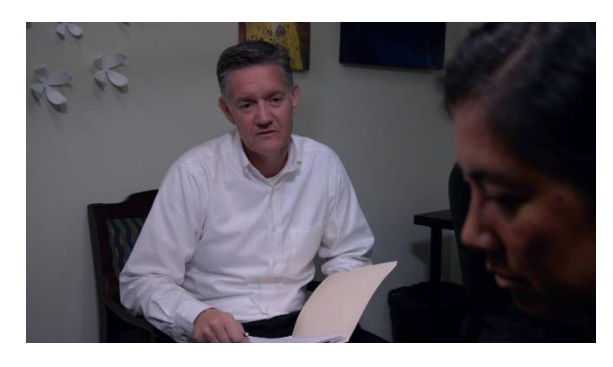
Tag Line Sacrifices must be made.